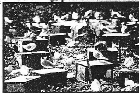
Numbered nest boxes for endangered roseate terns have succeeded in attracting inhabitants.